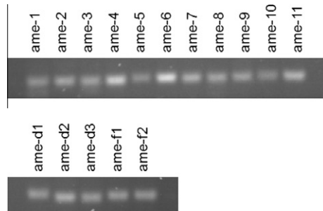
Fig. 2. Expression confirmation of novel miRNAs identified by cloning from foragers using stem-loop RT PCR.

ame-miR-210, ame-miR-282 and ame-miR-34 was over 2 (2.3-fold, 2.2-fold, 2.1-fold and 2.1-fold respectively). Ame-miR-iab-4, 133,13b, 2, 277, 317, 10, 92a, 124, 87, 14, 252, 33, 125, 929,276, 137,100, 190, 316, 1000, 927, 932, 7, 263b, 219, 981 and ame-ban-tam had a fold-change (absolute values) greater than 1 and less than 2.